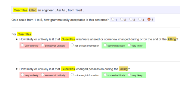
Figure 2: Example of semantic role decomposition task.

Multiple annotators with redundancy Reisinger et al.'s (2015) reason for not using redundant annotations was that a single annotator would provide internally consistent judgments, but this consistency comes at the cost of potential bias in the judgments.<sup>7</sup> In order to evaluate bias, we move to