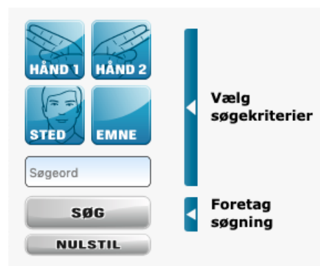
Figure 1: Traditional search functionality as seen in the online Danish Sign Language dictionary (Center for Tegnsprog, 2008).

The paper is structured as follows: in Section 2 we give an overview of methods that utilize Dynamic Time Warping in the gestural and sign language domain. In Section 3 we describe our methodology regarding the extraction of the body joint coordinates as well as the experimental setup, analysis, and visualization tool. In Section 4 we present the results of our experiments. We discuss them in Section 5 and conclude and motivate future research in Section 6.