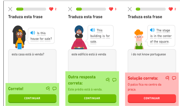
Figure 1: Translations proposed by English language learners at various levels of fluency, from diverse backgrounds. Our multi-checkpoint ensemble models mimic learner fluency. 4

The main set up of the 2020 Duolingo Shared Task on Simultaneous Translation And Paraphrase for Language Education (STAPLE 2020) (Mayhew et al., 2020) is such that one starts with a set of English sentences (prompts) and then generates high-coverage sets of plausible translations in the five